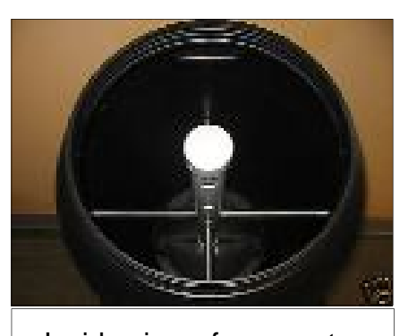
Inside view of composter