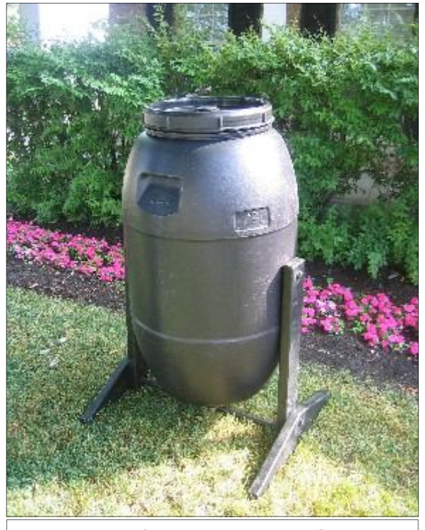
The color of the composter is black.